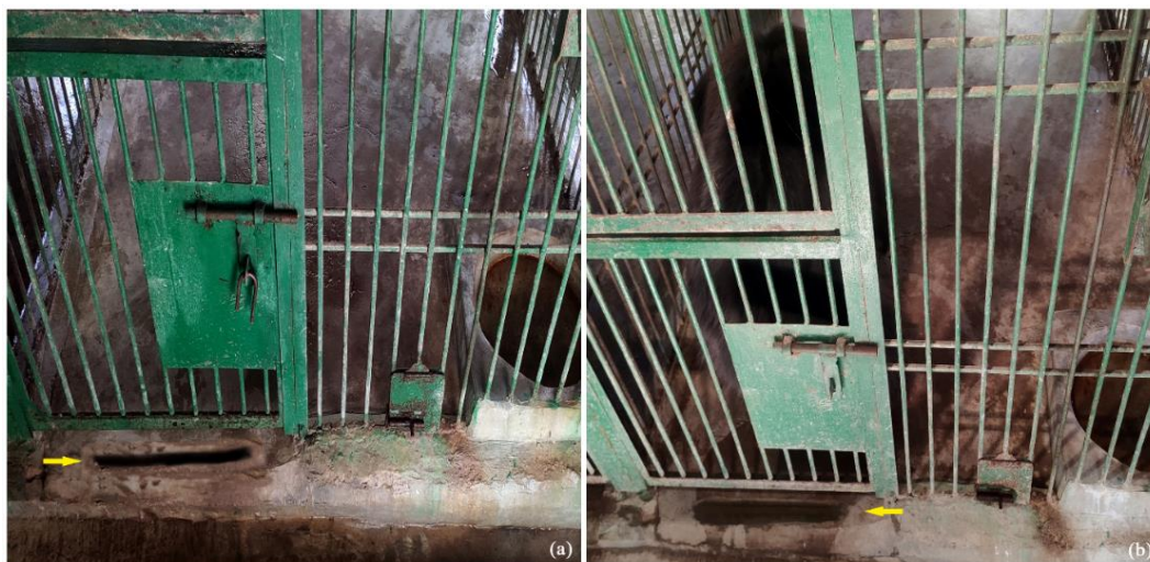
Fig 1: Yellow coloured arrow indicating the floor pit made at animal's enclosure (a) and accumulation of urine in the pit after urination (b)

profiling in M. ursinus illustrated the reproductive physiology and behavioural ecology of this iconic species [11, 12]. Earlier studies on the estrous cycle of M. ursinus has also observed an exhibition of wild instincts in captive conditions [13]. Reproductive status evaluation by hormonal monitoring for insemination and ovulation could bring successful reproduction in these animals. Even more, corticosteroid studies could be done to gather information about stress levels and so as necessary modification could be done in habitat and enrichments to adrenal activity diminution. By this method, we standardize the process of non-invasive urine sample collection is found to be less complicated in M. ursinus . Hence it is believed that the information obtained by this method would be invaluable for ameliorated veterinary care and in situ conservation.